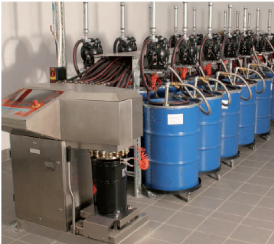
Tropic's new ink room boasts its Rexson Colorweigh Compact18.

customers' specifications, run after run. Another advantage of the system is the reduced stockholding of mixed ink due to the ability to accurately estimate ink requirements before printing and the option to make up small batches of identical ink, should the run lengths be increased.