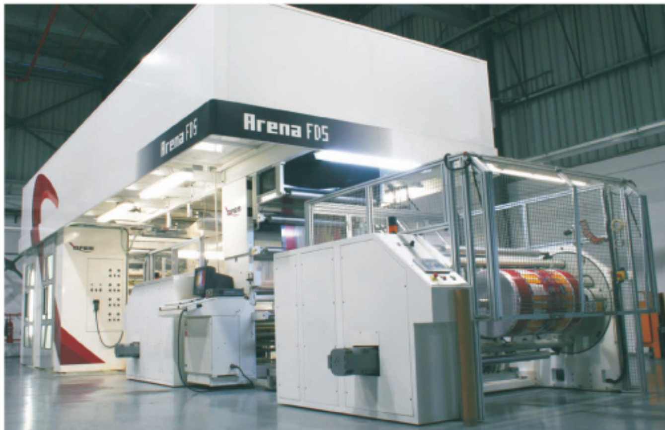
Tropic's Arena FD5 has pride of place on the company's pristine factory floor.

The company insists on forming solid partnerships with both customers and raw material suppliers. The bottom line is competitive pricing, fast turnaround times and all-important technical backup when required.